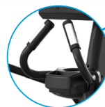
Fixed Handles to Isolate Lower Body