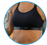
Telemetry Heart Rate Strap Included